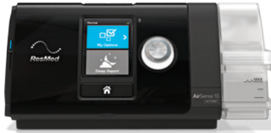
ResMed AirSense 10 AutoSet™ with built-in wireless connectivity,** HumidAir heated humidifier and ClimateLineAir heated tubing