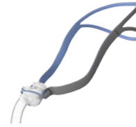
ResMed AirFit, Quattro Air or Mirage FX mask system (P10 mask pictured)